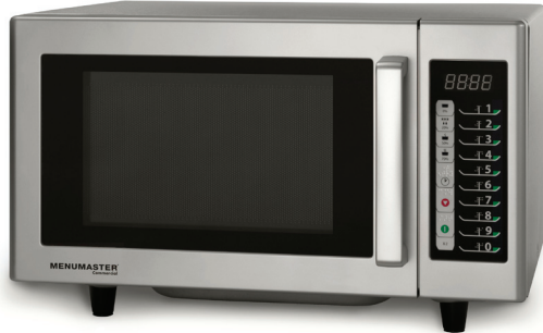
Model RMS510T shown