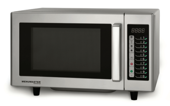
Model RMS510T shown