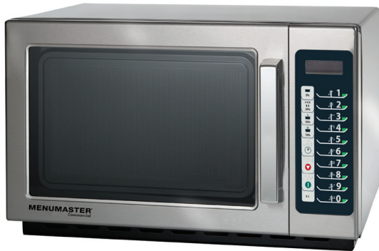
Model RCS511TS shown