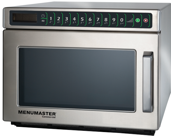
Model DEC18E2 shown